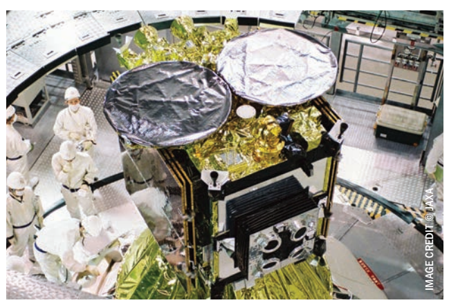
Engineers with the Japan Aerospace Exploration Agency work on Hayabusa 2 as the asteroid probe is attached to its H-2A rocket ahead of a December 3, 2014 (JST) launch target at the Tanegashima Space Center.

demonstrated an impressive final feat of engineering while returning to the desert in Woomera, Australia, when the sample return capsule underwent peak deceleration of 25 G, with heat about 30 times that experienced by the Apollo Command Module.